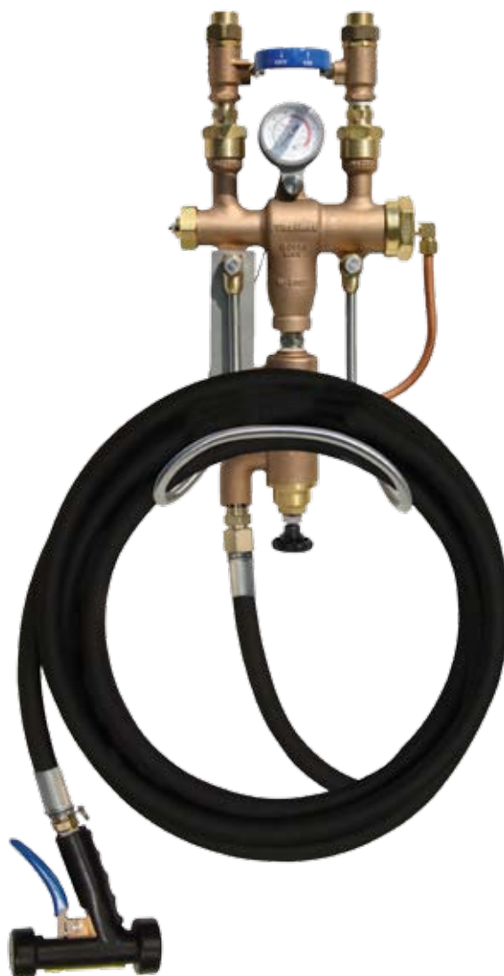
Shown: Bronze M-5000TS ; shown with premium hose assembly and M-70 Series nozzle

Please see reverse side for parts listing.